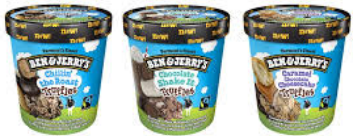
Baristas Ben & Jerry's Delivery