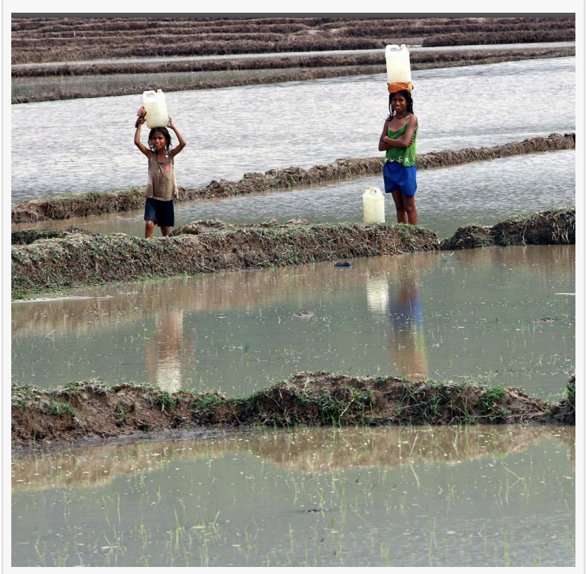
"The lack of water and sanitation disproportionately affects women and girls" -- Hon. Karina Gould

water resources, and the practical needs of political leaders and decision makers, particularly those in low- and middle-income countries.