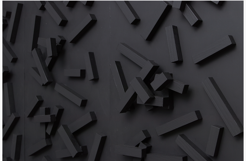
Featured Work from Kiyoshi Hamada's New Series, "2-2-17"