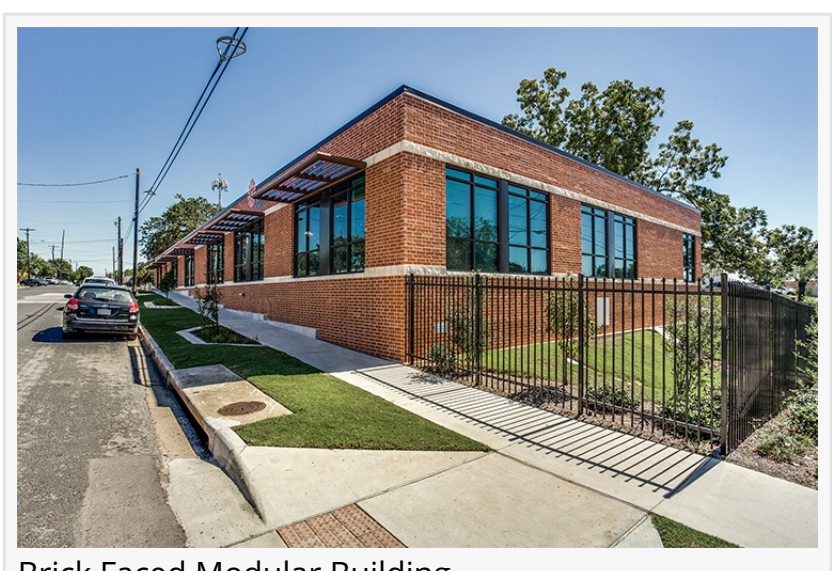
Brick Faced Modular Building

BOSTON, MA, USA, September 1, 2020 /EINPresswire.com/ -- The Covid 19 pandemic put the brakes on countless construction projects across the Country. Restricted access to sites, distancing protocols, lack of inspection officials and material supply disruptions, have all delayed or halted construction of commercial and residential construction over the past several months.