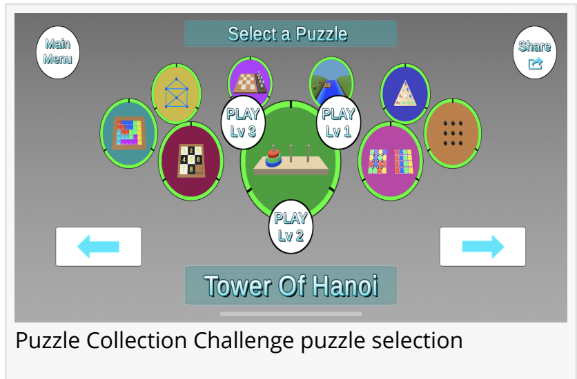
Puzzle Collection Challenge puzzle selection