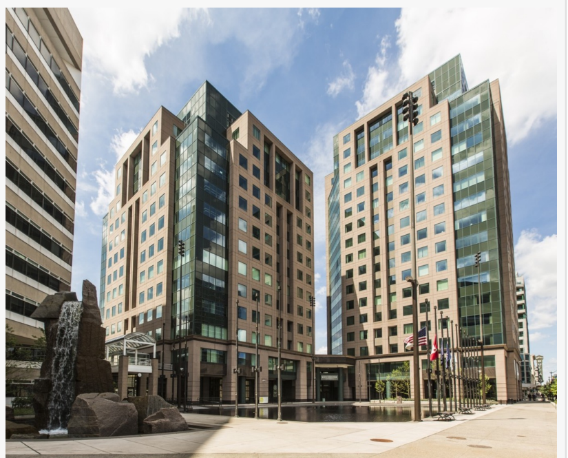
NexGen Fitness Buffalo Location

"We are excited to bring this new and unique fitness concept to the city of Buffalo, our hometown, and make an impact in the lives of our clients. With us all being current or former professional athletes we believe in NexGen's approach to health and fitness and we're excited about the partnership. We considered a lot of locations for the first New York NexGen, but decided that Buffalo was the best place," said Dan Gronkowski. "We love what is happening with its growth and wanted to be a part of the vibrancy in the city. Although NexGen is not geared solely to athletes and instead focuses on the goals of each individual client, you will definitely see the studio as a hot spot when professional teams come into town."