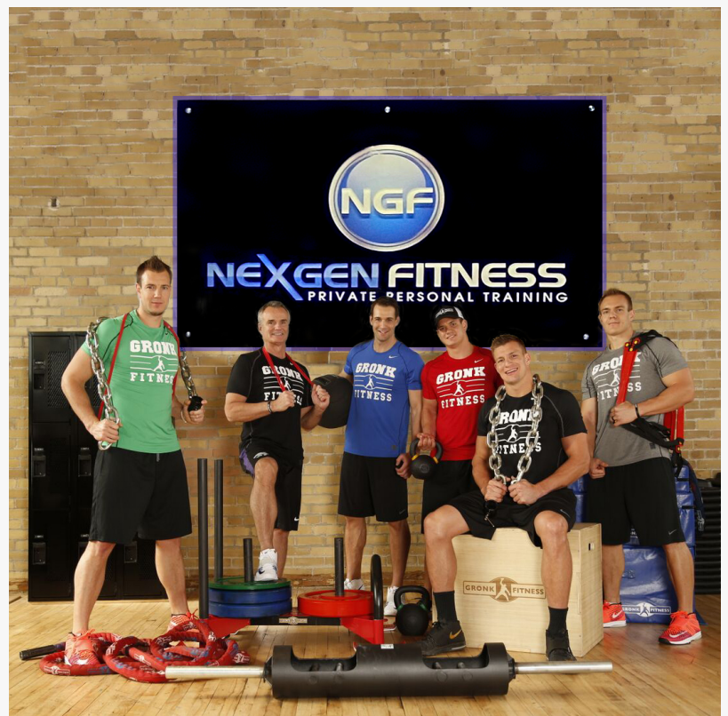
Gronk Nation to Open NexGen Fitness Buffalo