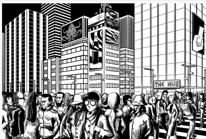
Storyboard image from JoinWith.Me, view of the City