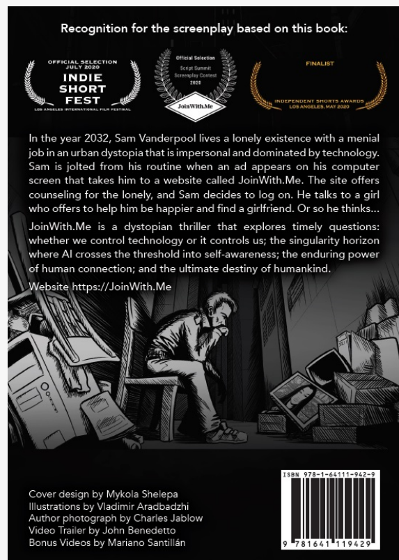
Back of Cover of JoinWith.Me book, available on Amazon