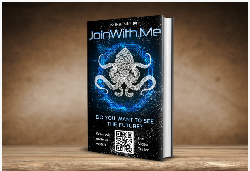
JoinWith.Me, book cover for hardcopy, with QR Code