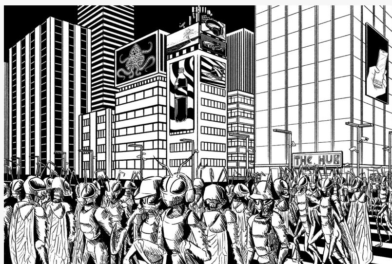
Storyboard image from JoinWith.Me, Sam's view of the City

This press release can be viewed online at: https://www.einpresswire.com/article/525057861