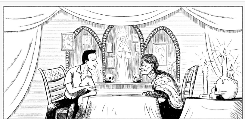
Storyboard image from The Love Hex or Nicest Flings in Mexico, the Town Witch, Curandera