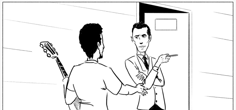
Storyboard image from The Love Hex or Nicest Flings in Mexico, meeting Agustin Lara