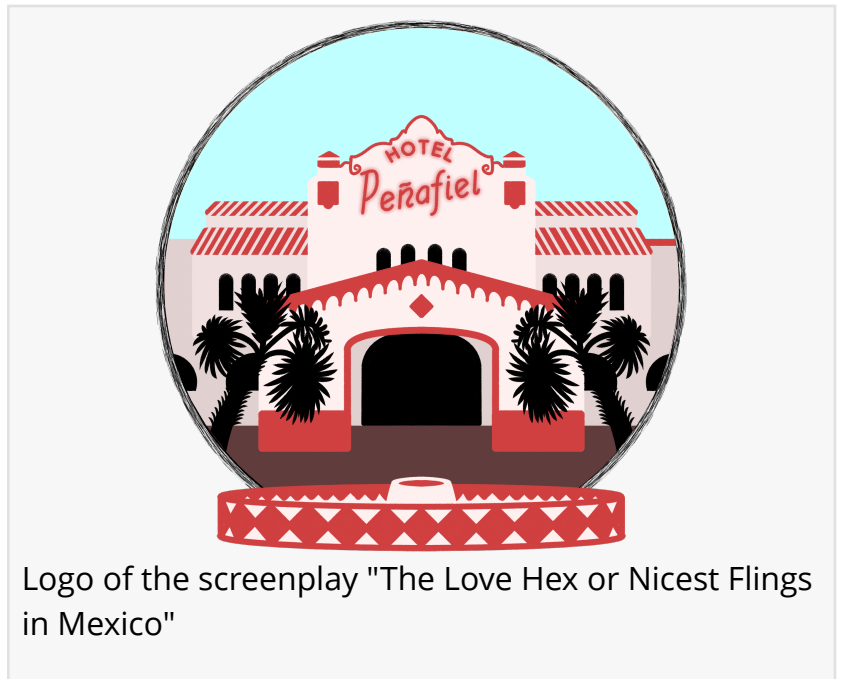
Logo of the screenplay "The Love Hex or Nicest Flings in Mexico"

In brief, the storyline is: In Long Island, 1929, Rose Hayes lives unhappily married to a cheating older man, Spencer, who works as a lawyer. Rose suffers from arthritis and is advised by her doctor to travel to Tehuacán, a city in Mexico known for its miraculous hot springs. After convincing Spencer of the trip's benefits, she invites her best friend, Alice, whose husband passed away and is struggling to recover from her grief. The women arrive, and immediately meet Miguel and Ramiro. Miguel takes it upon himself to show the ladies the beauty of Tehuacán, and street artist and gigolo Ramiro joins in, since he's used to starting affairs with American tourists. Miguel falls in love with Rose, and a spell performed by a curandera (the town's witch) causes Ramiro to fall for Alice. The two couples' love needs to overcome the challenges that come with dating in the roaring 20s, when a controlling husband and a pinch of magic is involved.