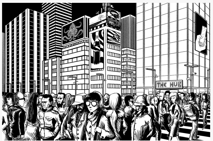
Storyboard image from JoinWith.Me, view of the City