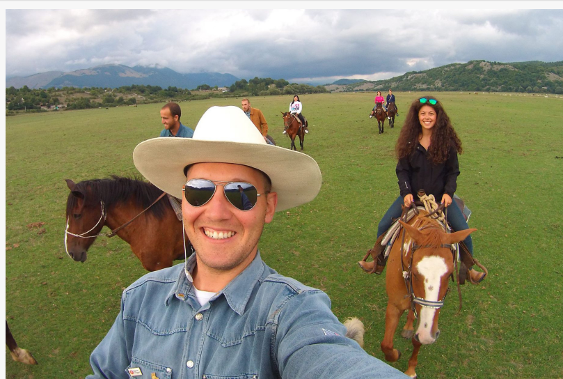
A group from Ranch Briona rents horses to explore the valley below Mundunur village.

This press release can be viewed online at: https://www.einpresswire.com/article/525086736