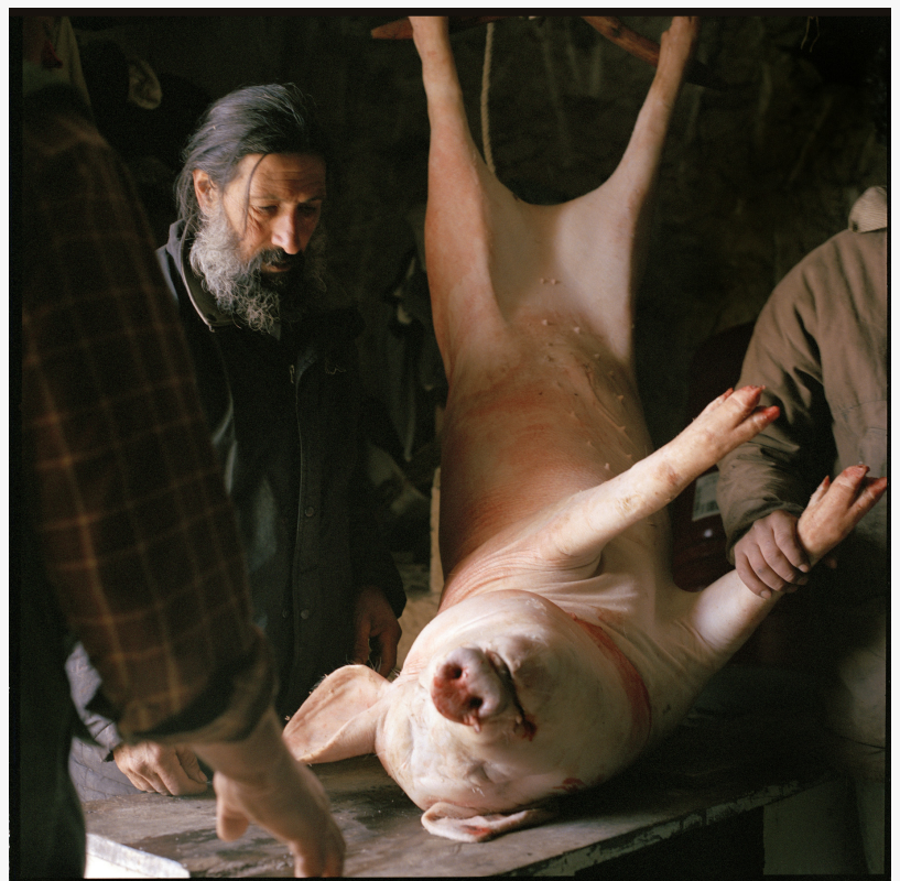
Pig slaughter according to ancient traditions in the high mountains of Molise.

This book fills a void in local historiography for the Molise region and offers insights into the history and evolution of hundreds of small towns across the south. The history of the village can also serve as an allegory for any place in the world where the forces of history and culture forge people's character.