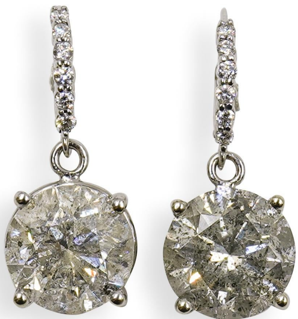
Pair Of 10 Carat Diamond and Gold Stud Earrings