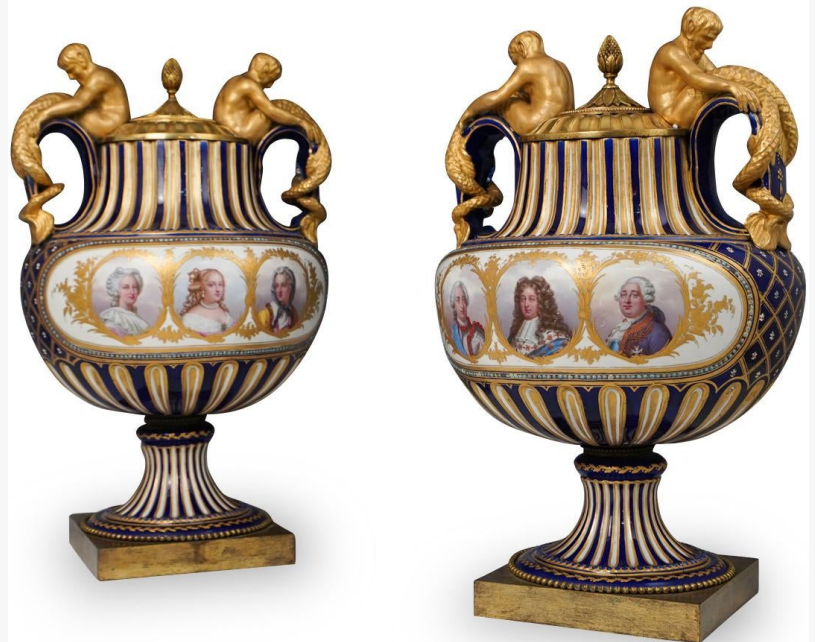
Pair of Monumental Sevres Royal Urns

Several luxury bags will also feature in this. Like a Hermès black leather Constance tote ($3,000 - $6,000) recognized by their "H" emblem on the front and their adjustable leather straps, similar in style to the Birkin and Kelly bags from the brand. The offered Cartable-sized bag, the largest in the Constance line, measures 11 inches high by 11 inches long.