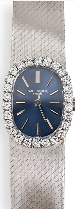
Vintage Patek Philippe 18K & Diamond Ellipse Lady Watch

https://www.liveauctioneers.com/catalog/176484_an-eclectic-collection-and-estate-jewelry-sale/