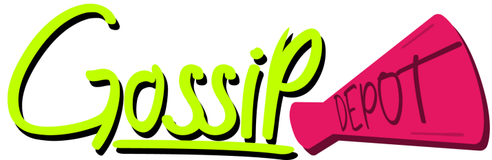
Gossip Depot Logo

have to wait.” The site’s soft launch, to some extent, has been a victim of its own success. A spike in traffic upon launch overwhelmed the nascent social network’s technical infrastructure. James decided to pause the website’s full deployment until its new launch, February 2021, while its being rebuilt. While current and new users can still sign up and have access to the social network aspects of the site, the launch of the New Gossip Depot won’t come until February 1, 2021.