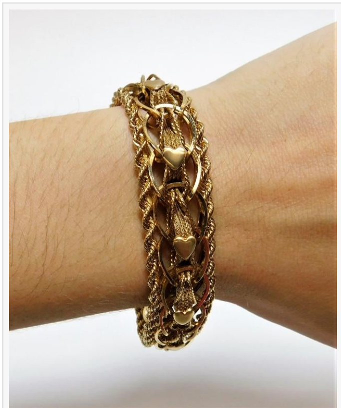
Gorgeous 14kt gold braided rope multi-twist bracelet with heart detailing, made in America circa 1960 and weighing 45.4 grams, 7 ½ inches long ($1,625).

Travis Landry Bruneau & Co. Auctioneers +1 401-533-9980 email us here