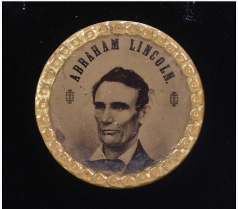
Abraham Lincoln political campaign ferrotype from around 1860, depicting a clean-shaven Lincoln in a circular format, surrounded by a chased brass frame ($1,625).