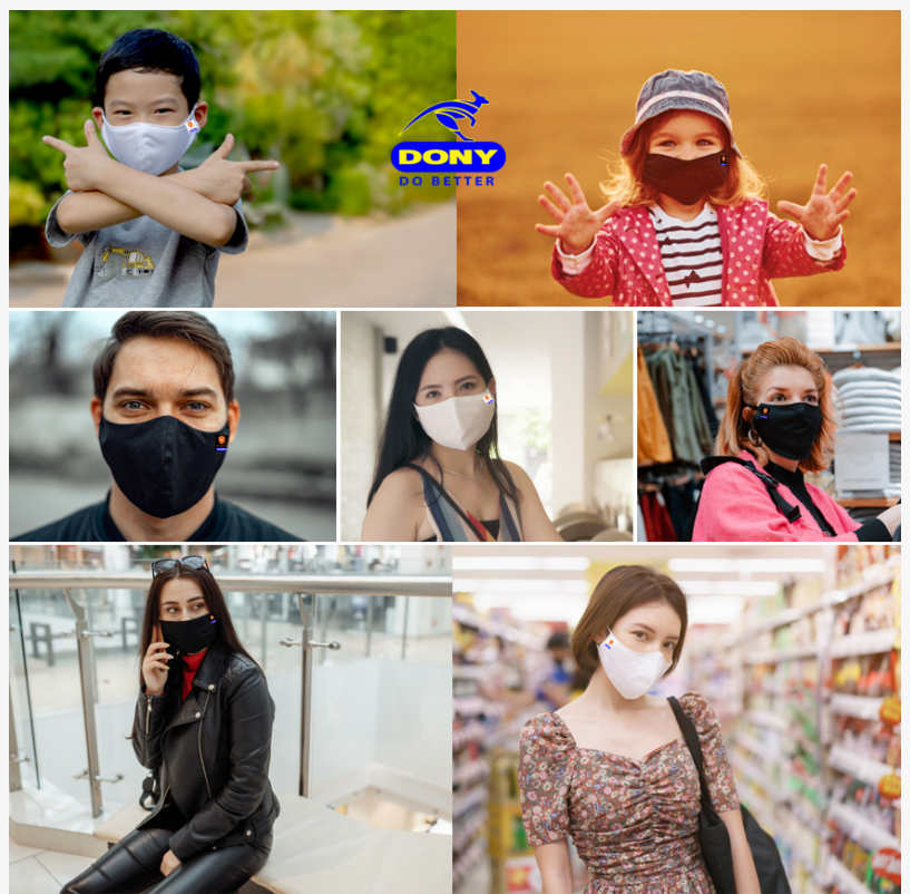
DONY MASK - premium antibacterial cloth face mask (washable, reusable) with CE, FDA, TUV Reach, DGA Certification

This is what makes Dony mask superior and exceptional compared to its counterparts in the export market worldwide.