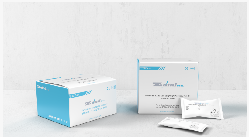
ZandCell COVID-19 Rapid Test