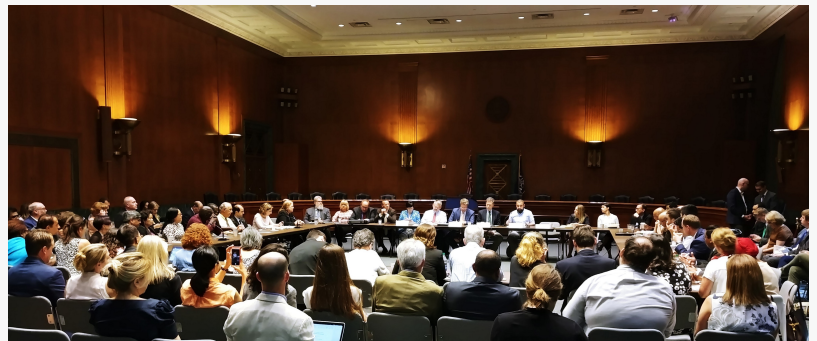
Over 140 International Religious Freedom Roundtable participants meeting on Capitol Hill before COVID-19

Reports in the form of firsthand accounts, video footage and studies have been leaking out of