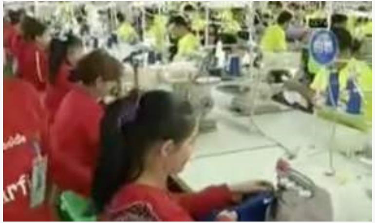
World Uyghur Congress