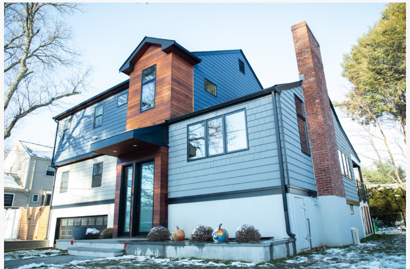
Silver Medal Winner in Whole Home Remodel under $500,000