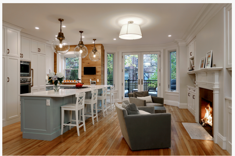
Gold Medal Winner in Whole Home Remodel Condominium