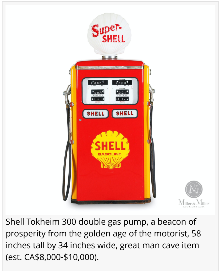
Shell Tokheim 300 double gas pump, a beacon of prosperity from the golden age of the motorist, 58 inches tall by 34 inches wide, great man cave item (est. CA$8,000-$10,000).

The Shell Tokheim 300 double gas pump is a true beacon of prosperity from the golden age of the motorist. This iconically designed pump makes the same glowing statement as the cars of the era. It was the recipient of a master restoration and measures 58 inches tall by 34 inches wide by 16 inches deep. Gas pumps are hugely popular as man cave items.