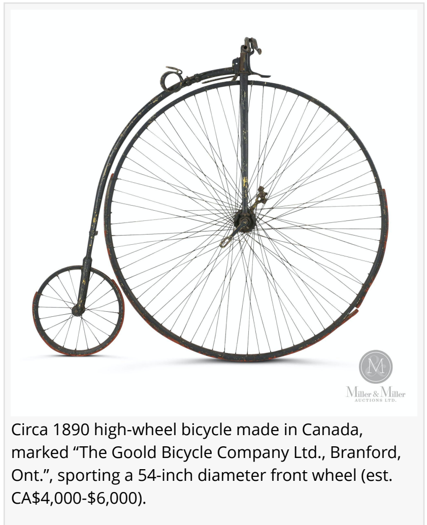
Circa 1890 high-wheel bicycle made in Canada, marked "The Goold Bicycle Company Ltd., Branford, Ont.", sporting a 54-inch diameter front wheel (est. CA$4,000-$6,000).