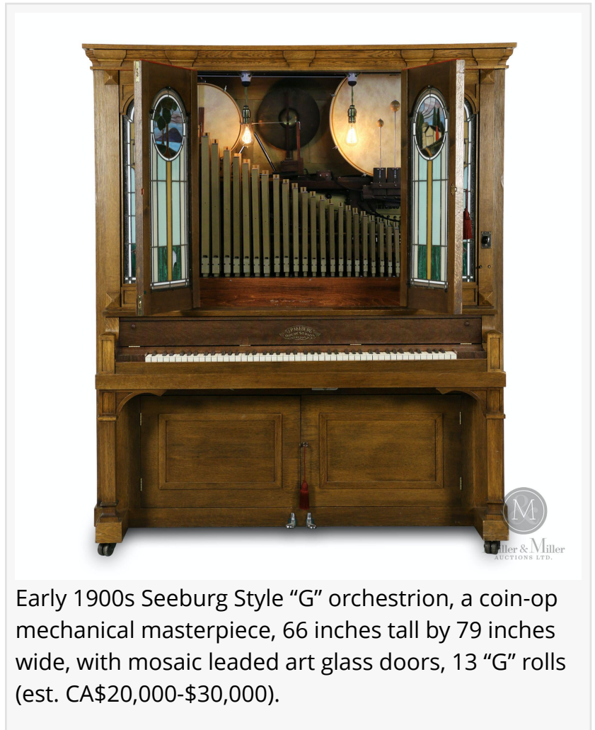
Early 1900s Seeburg Style “G” orchestrion, a coin-op mechanical masterpiece, 66 inches tall by 79 inches wide, with mosaic leaded art glass doors, 13 “G” rolls (est. CA$20,000-$30,000).

The Seeburg Style “G” orchestrion is the expected top lot of the auction. The player piano melody