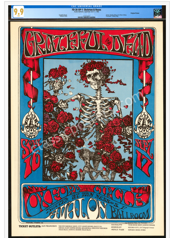
The Finest Certified 1966 FD-26 Grateful Dead Poster - CGC 9.9