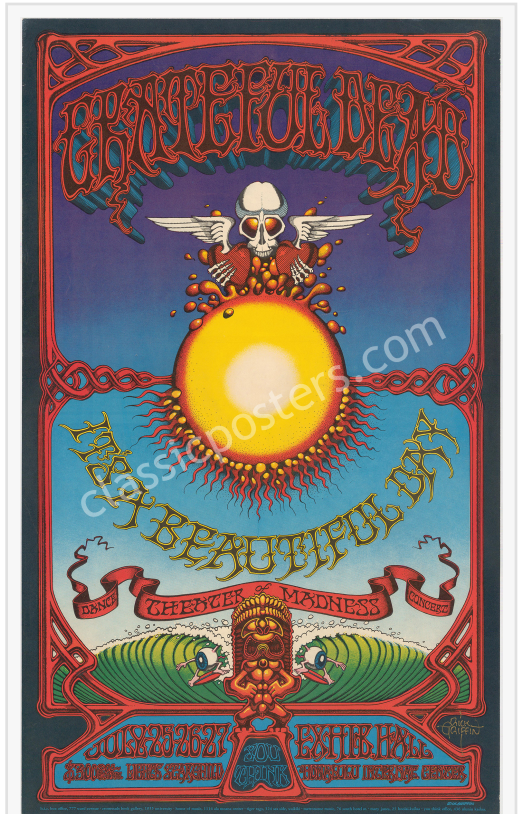
AOR 3.116 Signed 1969 Grateful Dead Hawaiian Aoxomoxoa poster