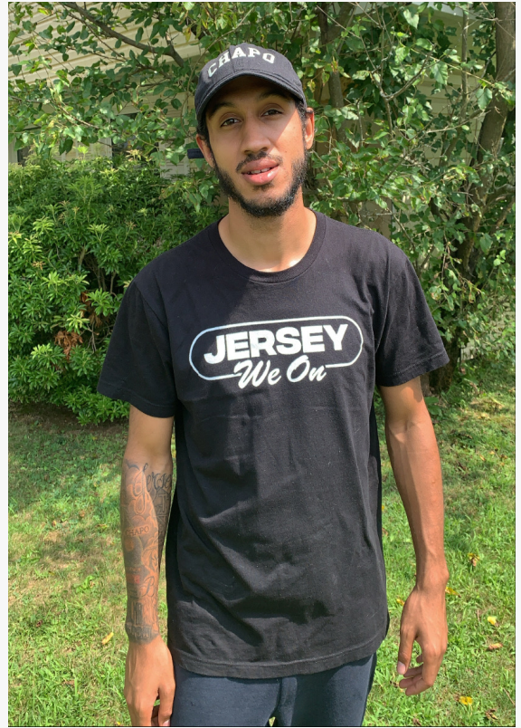
Cutty W/ Cutty TV Merch