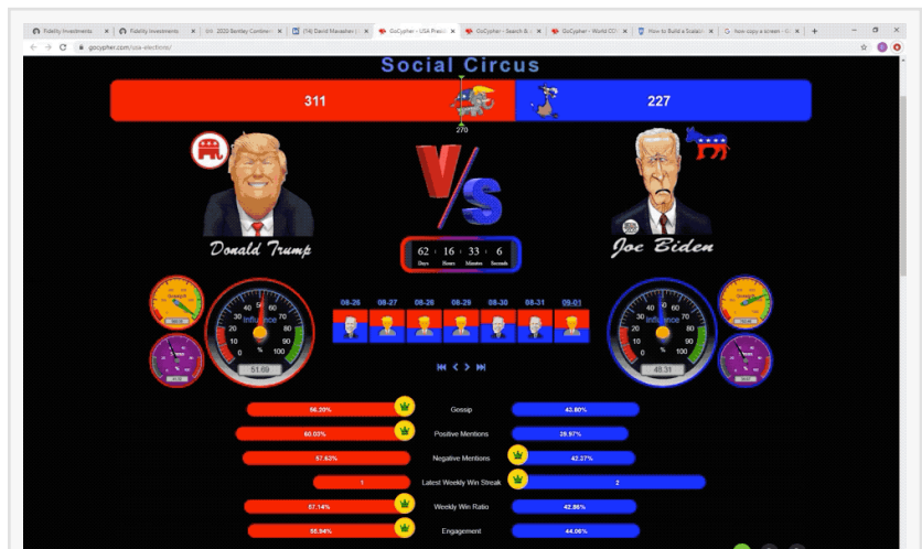
The US Presidential Elections

You will see the applied analytics to the real-time feeds of all the Tweets and Reddit posts that are associated with the US presidential elections. The data is categorized and analyzed in real time and grouped as Gossip, Positive and Negative public sentiments and the impact on the Electoral College per state. The system projects a winner in real time, and you may be surprised how some states are flipping! It provides a different view of the social-media and public mood about the presidential candidates, in ways that no one else is considering and is very different from any of the polls.