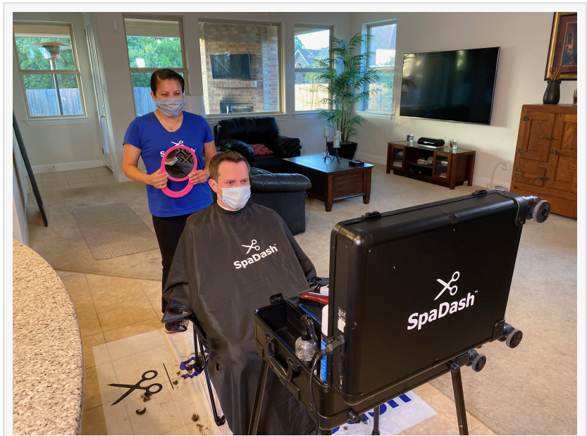
Mobile Haircut Delivery

AUSTIN, TX, USA, September 8, 2020 /EINPresswire.com/ -- SpaDash, Austin's leading mobile haircut delivery company, reported today the expansion of their central Texas service area in order to administer more customer in home haircut appointments. The mobile haircut company already services the Austin area, including Cedar Park, Round Rock, Pflugerville, Georgetown and Leander. With the addition of new licensed stylists on the SpaDash app, even more haircut delivery appointments will be available in the surrounding areas, matching the demand seen in the market.