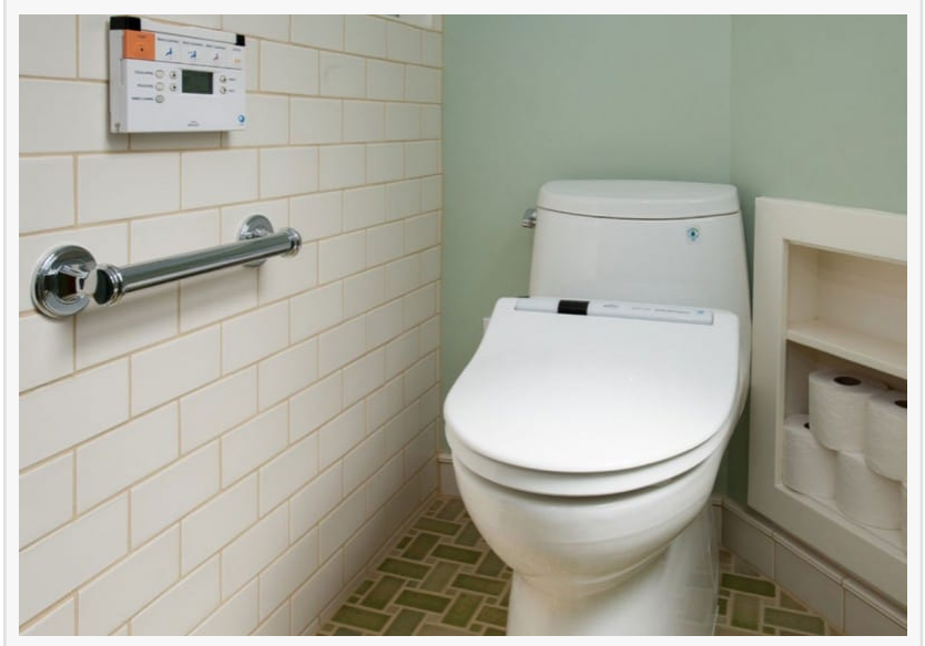
Handrails in the shower and near the toilet make the bathroom safer for your loved one.