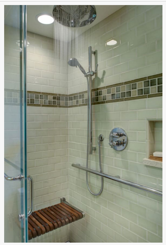
Custom walk-in showers with built in benches are a great option for a senior's bathroom remodel!

Luxurious whirlpool jets Heated backrest Hand-held shower head Fast draining mechanism Extra-wide door & seating Low step threshold Handrails Slip resistance flooring Easy-to-use control panel While the installation and initial cost may seem like a lot, the features and added safety more than make it worth the price. Adding a walk-in tub makes aging in place all the more possible. Meanwhile, the added comfort features enhance the quality of their independent lives.