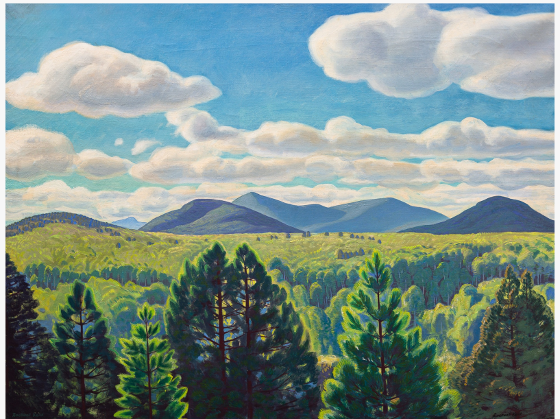
Painting by Rockwell Kent (American 1882-1971) titled Tree Tops and Mountain Peaks , done in 1960 and shown and at The Adirondack Museum in Blue Mountain Lake, N.Y. (est. $80,000-$120,000).