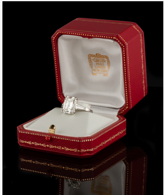
Silver and estate jewelry highlights include this stunning Cartier 7.55-carat diamond and platinum ring (est. $125,000-$175,000).