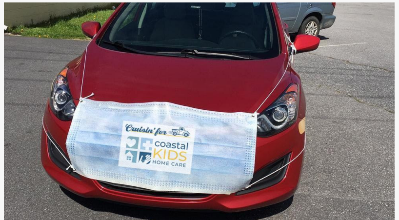
A Car Wears Special Mask for Cruisin' for Coastal Kids Home Care