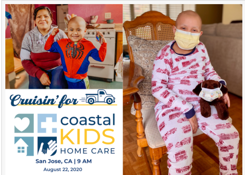
Cruisin' for Coastal Kids Home Care and Some Patients

Coastal Kids Home Care improves the quality of life for children healing from injury or short-term illness, coping with chronic conditions or developmental delays, and those facing the end-of-life. Their staff provides in-home nursing, specialized therapies, mental health services, social