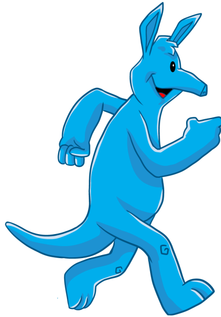
AARDY Insurance Running