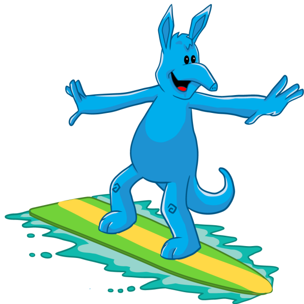
AARDY Insurance Surfing