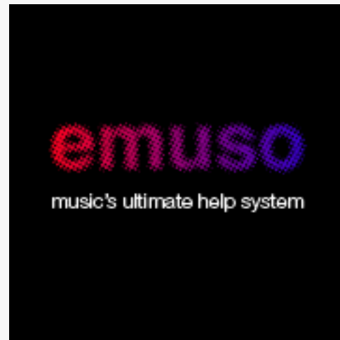
emuso color logo