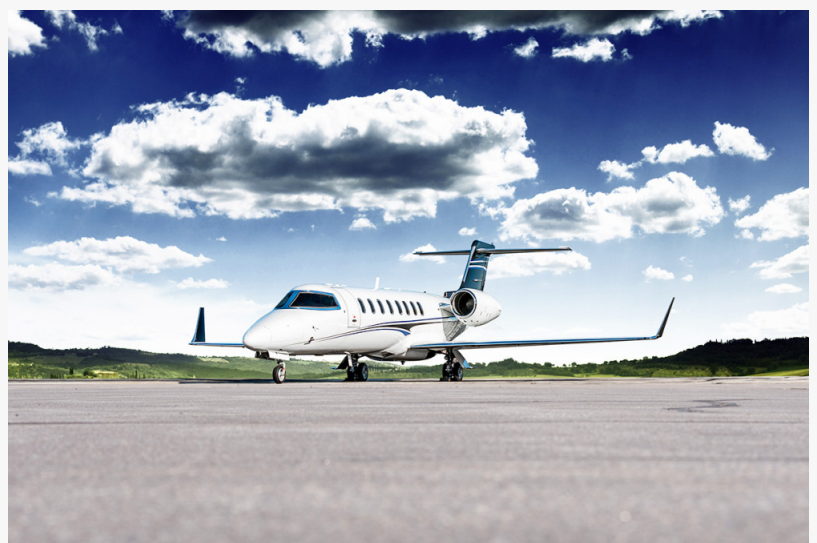
2012 Bombardier Learjet 45XR listed by Elliot Jets, of Moline, Ill. on www.AircraftExchange.com , IADA's aircraft marketplace.