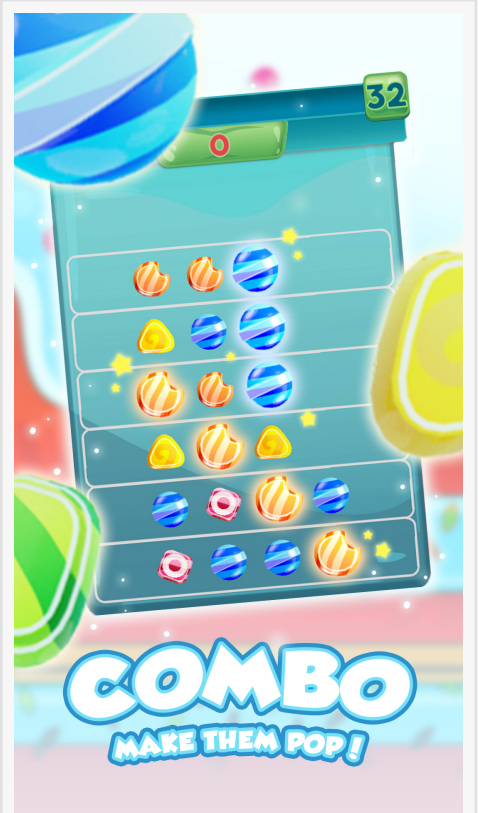
Matchy Catch Gameplay 02