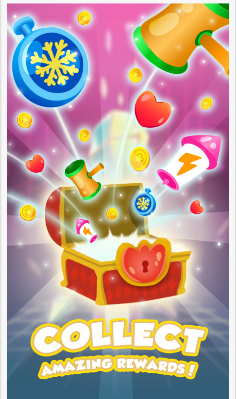
Matchy Catch Gameplay 03