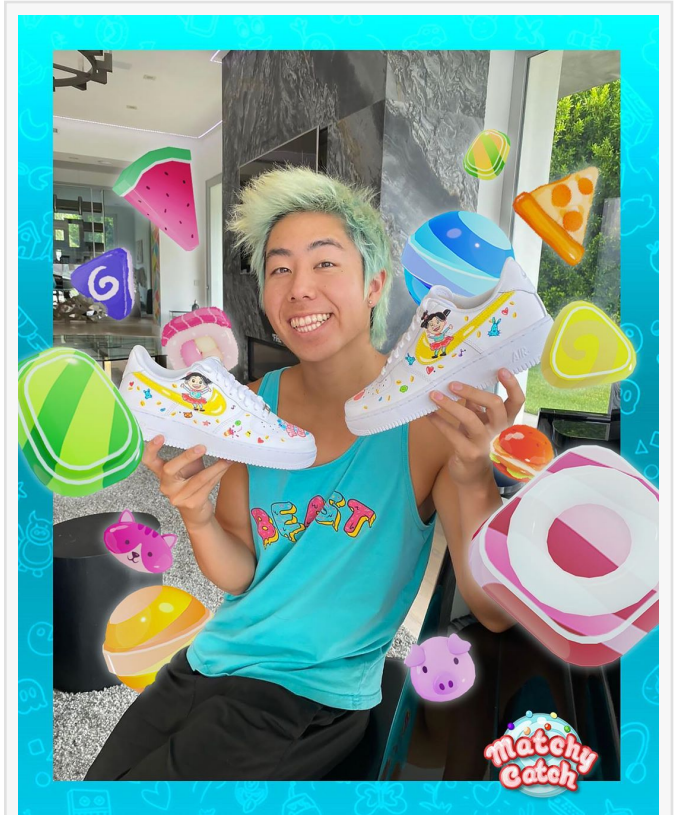
Matchy Catch x ZHC Giveaway

Matchy Catch is available on September 17th, along with the giveaway with ZHC kicking off on the same day.