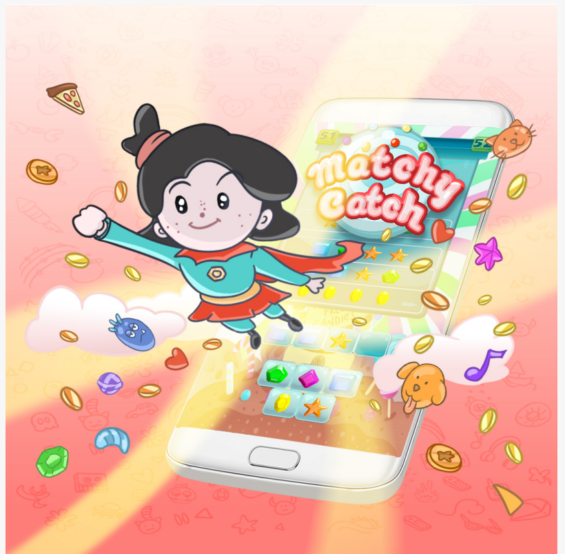
Matchy Catch: A Colorful and addictive puzzle game