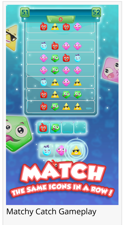
Matchy Catch Gameplay

This press release can be viewed online at: https://www.einpresswire.com/article/526202911