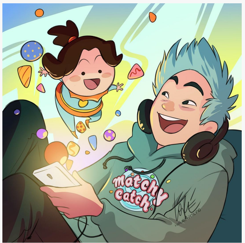
Matchy Catch x ZHC giveaway - artwork by Lorenza di Sepio