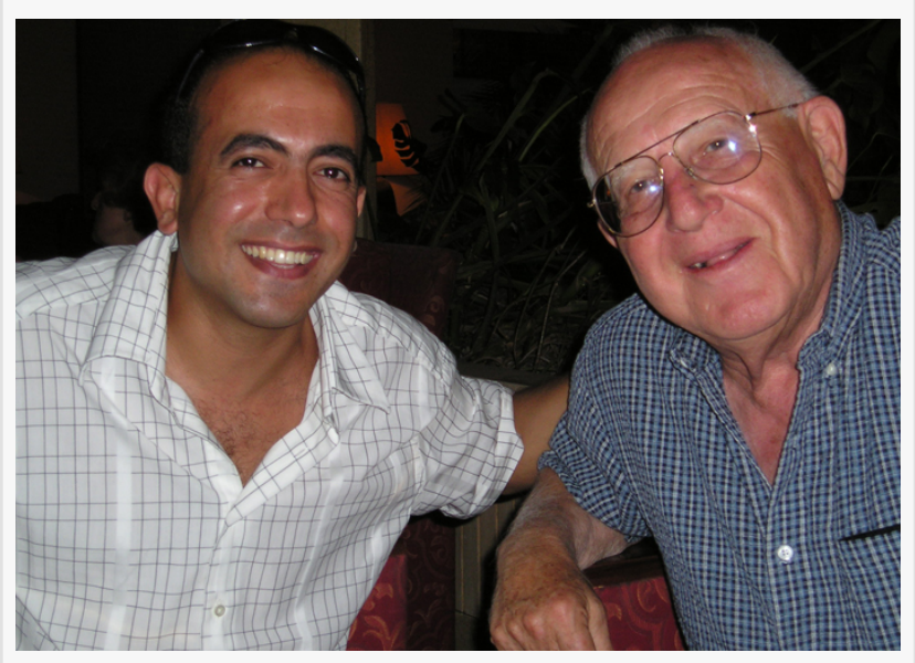
Radwan's efforts impressed the Holocaust survivor Branko Lustig, producer of "Schindler's List"

Ahmed arranged a number of meetings between Arab and Israeli media people as well as peace activists at various film festivals.