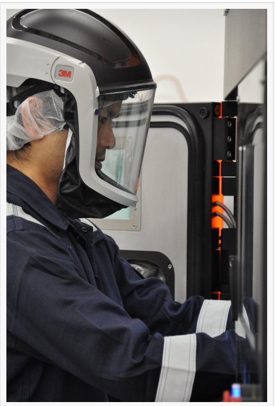
A PrinterPrezz technician prepares 3D printer to build medical devices enabling distributed design and manufacturing for partners worldwide.

PrinterPrezz's mission is to bring more ideas for innovative medical devices to market faster, connecting medicine and manufacturing to become the first Medifacturing<sup>™</sup> company in the world. By developing advanced medical devices using processes that combine expertise in 3D printing, orthopaedics, semiconductor and nanotechnologies, PrinterPrezz's ultimate goal is to provide medical solutions that enable people to enjoy active lives longer. PrinterPrezz's ecosystem aims to solve challenges for various parts of the medical innovation value chain by providing prototyping, development, and manufacturing services to create life-enhancing medical devices. PrinterPrezz provides customers with access to a variety of 3D printing machines, 3D manipulation software, and 3D scanners as well as advanced manufacturing processes, and surgeon education programs. Medical solutions created by PrinterPrezz are designed to enable more people to live happier and more gratifying lives. For additional information about the company, please visit <u>www.printerprezz.com</u>.