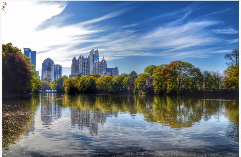
Skyline of Atlanta GA