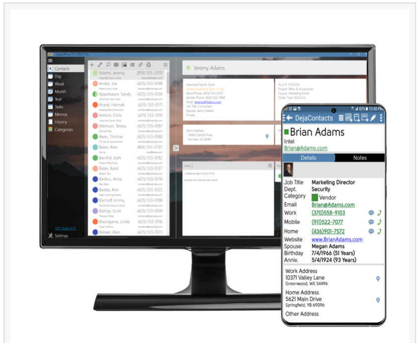
DejaOffice PC CRM

DejaOffice is sold with an optional RunStart setup with data transfer for $49, or Premium Support for $129. Both services allow a tech to log in your computer and set things up exactly as you need. It is very common for CompanionLink technicians to set your office up by importing