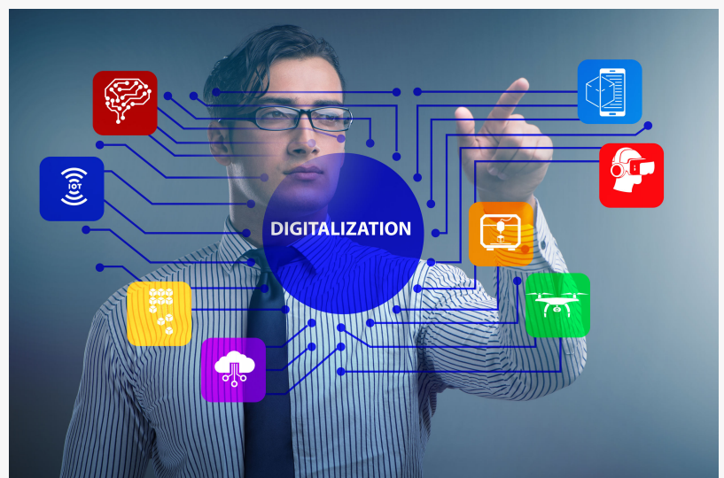
Ongoing FSMA Compliance Digitalization