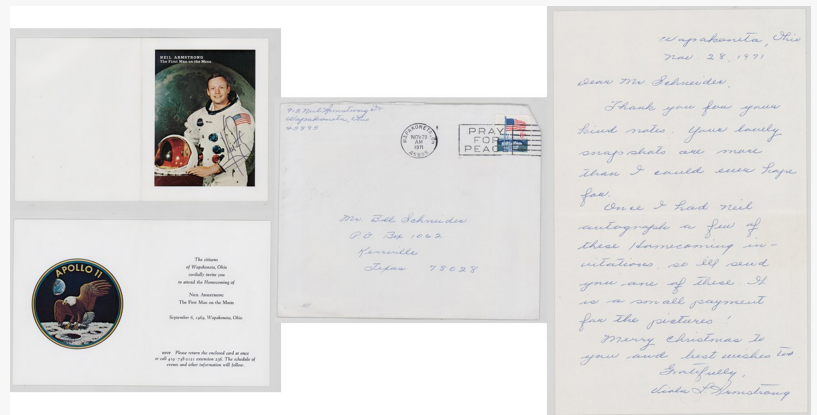
Neil Armstrong signed invitation to a September 1969 Homecoming, with a letter from Armstrong's mother. The astronaut's signature is nice and bold (est. $500-$800).