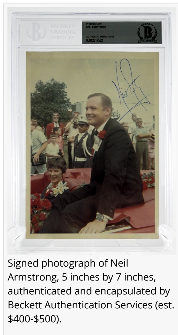
Signed photograph of Neil Armstrong, 5 inches by 7 inches, authenticated and encapsulated by Beckett Authentication Services (est. $400-$500).

Other noteworthy lots include a 5 inch by 7 inch photo signed by Buzz Aldrin, depicting the astronaut signing an autograph, the signature bold and the photo in excellent condition (est. $150-$200); and a pair of 1935 National Air Races (Cleveland) executive and committee badges, each one having a metal pin with silk ribbons, 4 ¼ inches from top to bottom (est. $100-$200).