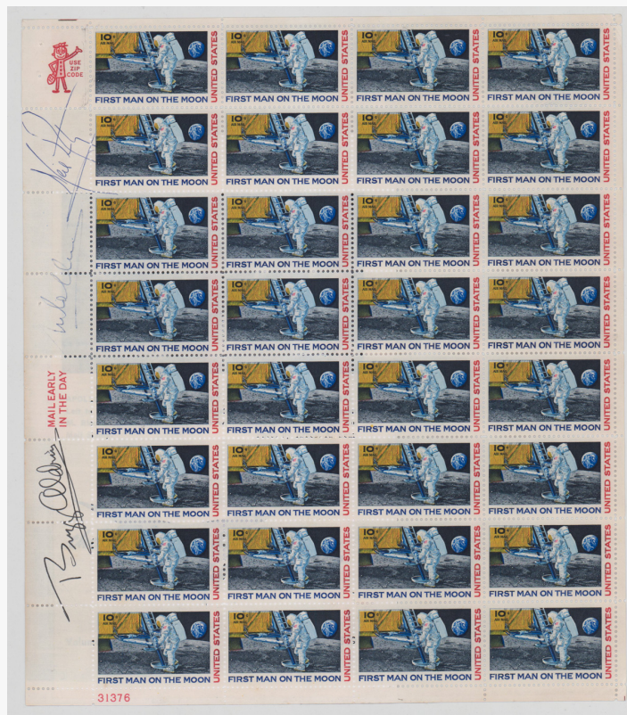
Full sheet of Apollo 11 10-cent U.S. stamps ("First Man on the Moon") signed by Neil Armstrong, Buzz Aldrin and Michael Collins (est. $1,000-$2,000).