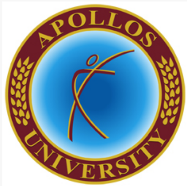
Apollo University Seal

This press release can be viewed online at: https://www.einpresswire.com/article/526312567