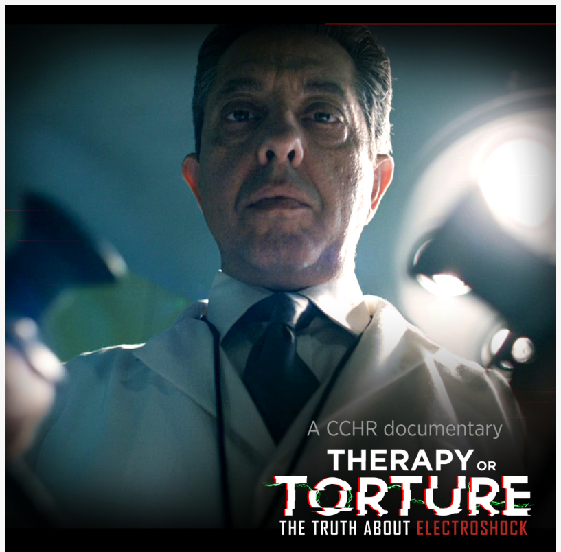
The American Psychiatric Association (APA) recommended brain damage be removed from the ECT consent form and the FDA acted on this in a “Final Order” issued on ECT in December 2018.