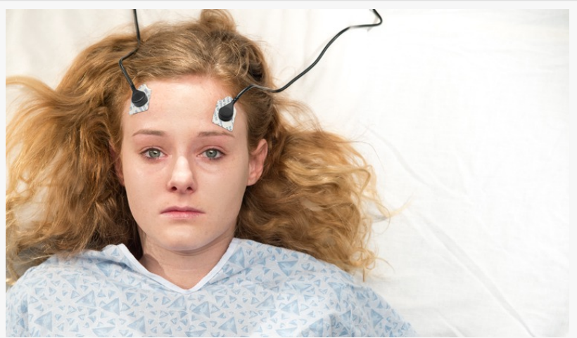
Children between the ages of 0–5 are being shocked under the guise of “treatment.”

About CCHR: Initially established by the Church of Scientology and renowned psychiatrist Dr. Thomas Szasz in 1969, CCHR’s mission is to eradicate abuses committed under the guise of mental health and enact patient and consumer protections. L. Ron Hubbard, founder of Scientology, first brought psychiatric imprisonment to wide public notice: “Thousands and thousands are seized without process of law, every week, over the ‘free world’ tortured, castrated, killed. All in the name of ‘mental health,’” he wrote in March 1969. For more information please visit www.cchrflorida.org .