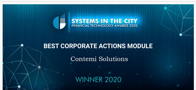
Contemi Wins Best Corporate Actions Module Award

Contemi Corporate Actions Module illustration