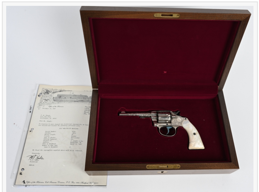
Antique 1897 Colt .32-caliber 'New Police' revolver with American-scroll engraving by Cuno Helfricht. Solid 99% gun with near-mint bore and action. Comes in modern Colt walnut fitted case. Estimate $7,000-$10,000

Also made by Colt, a US Model 1903 .32-acp Pocket Hammerless 'U.S. PROPERTY' pistol was commonly known as the General Officers Model. Milestone will auction an example of this gun, manufactured in 1942, in as-new condition and with a perfect bore and matching numbers. It retains its original box and pictorial instructions sheet and is expected to make $3,500-$4,500.