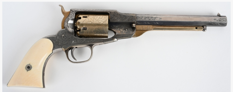
Remington Beals Navy revolver made only in the years 1861-62, .36 bore, 7¼ in barrel, exquisite engraving attributed to L.D. Nimscke. Arguably the finest, most highly decorated revolver of its type extant. Estimate $12,500-$17,500

European highlights include firearms by Ruger, Glock Sig Sauer, Beretta, Browning, Mauser, as well as several noteworthy antique weapons. Made in the 1860s, an English .32 bore percussion knife gun stamped "James Rogers Sheffield" is entered with a $2,500-$3,500 estimate. A circa-1760 Revolutionary War Dutch flintlock musket, one of a shipment sent to Massachusetts with the help of Benjamin Franklin, has an auction target of $3,000-$4,000. Also of great interest, a scarce antique 4-barrel, .476-caliber Eley multi-shot, big-bore handgun is of a type that was favored by British army officers stationed in India. With all variations considered, fewer than 1,000 of this type of gun were made. Its top barrel rib is stamped "CHARLS LANCASTER (PATENT) 151 NEW BOND ST LONDON," and all four barrels are British proofed. This rare, high-condition gun is estimated at $5,250-$7,500.