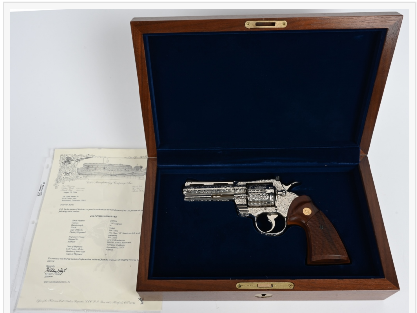
Cased, factory engraved Colt 4in nickel Python .357 Magnum in like-new, unfired condition in walnut Colt display case. Factory letter states gun was shipped to buyer in 1979. Estimate $7,000-$9,000

WILLOUGHBY, OHIO, UNITED STATES, September 17, 2020 / EINPresswire.com/ -- Milestone Auctions' Premier Firearms Auction is an event that collectors of antique and modern guns have elevated to "must-attend" status. Known for its tremendous variety of high-quality arms and authoritative catalog descriptions, Milestone's Premier sales traditionally feature rifles, shotguns, pistols and revolvers made by the most respected American and overseas manufacturers. The company's next Premier Firearms Auction is slated for Saturday, Sept. 26 at Milestone's suburban-Cleveland gallery, with all forms of remote bidding available, including absentee, phone and live online.