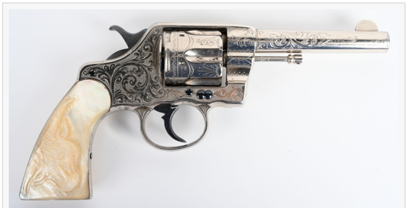
Antique Cuno Helfricht-engraved Colt Navy .41-caliber revolver, pearl stocks with carved steer head. Shipped in 1897. Estimate $8,000-$12,000

A fine Remington Beals Confederate 1st Model Navy .36-bore percussion revolver, one of only 200 made in 1861-'62, is stamped "G. Trott" on the butt end of both grips and bears the serial number "95." Milestone Auctions' scrupulous research revealed that the gun was the very one Confederate Lt. George Trott carried with him on the day he was killed at the June 25, 1862 Battle of Seven Pines in Virginia. Its auction estimate is $8,000-$10,000.