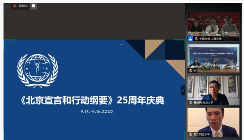
25th Anniversary of Beijing Declaration--China session