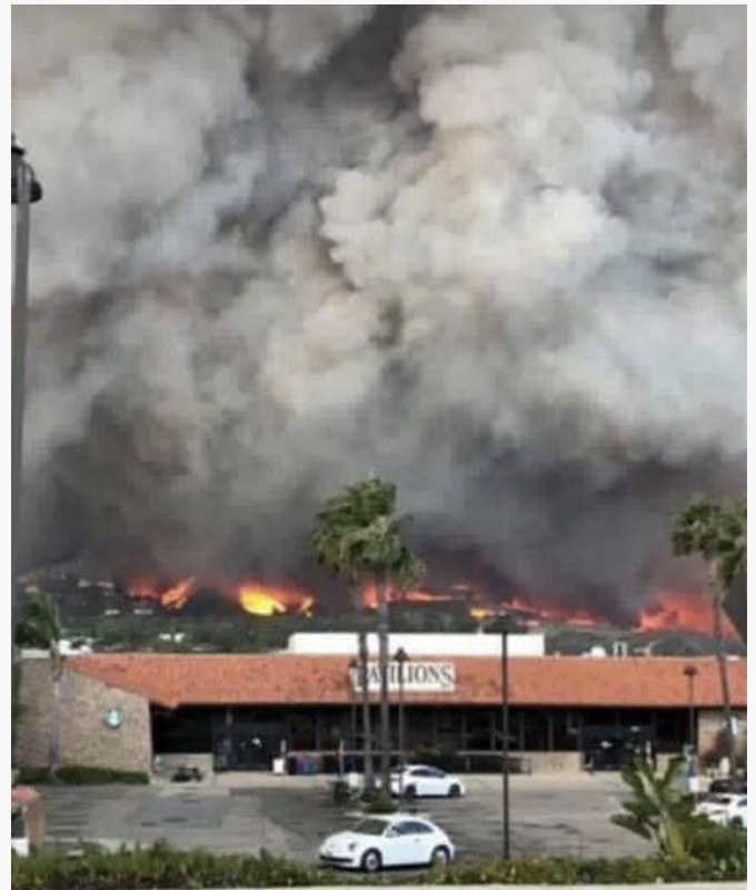
Malibu burning during the 2018 Woolsey Fire.