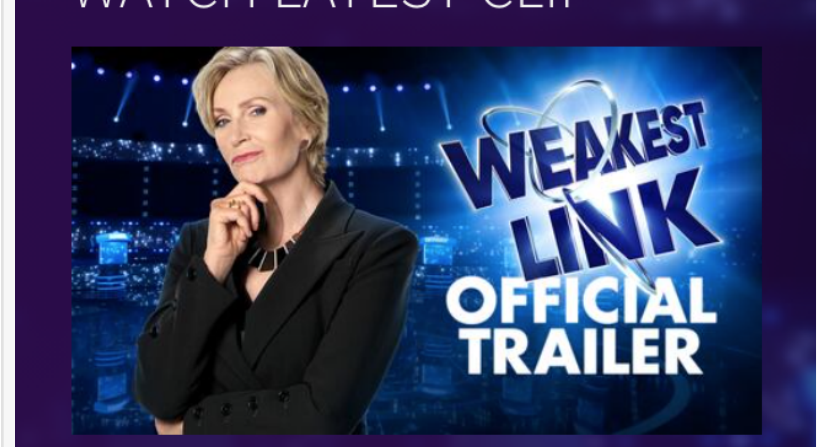
Jane Lynch host of "Weakest Link"

The Weakest Link originated in the U.K. and spawned many international versions, including an American version that aired on NBC from 2001 to 2003. The new version will remain true to the original, just a brighter better looking set.