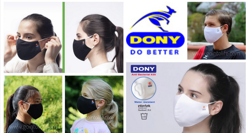
Dony Mask meet all the rigorous requirements for global export and use.