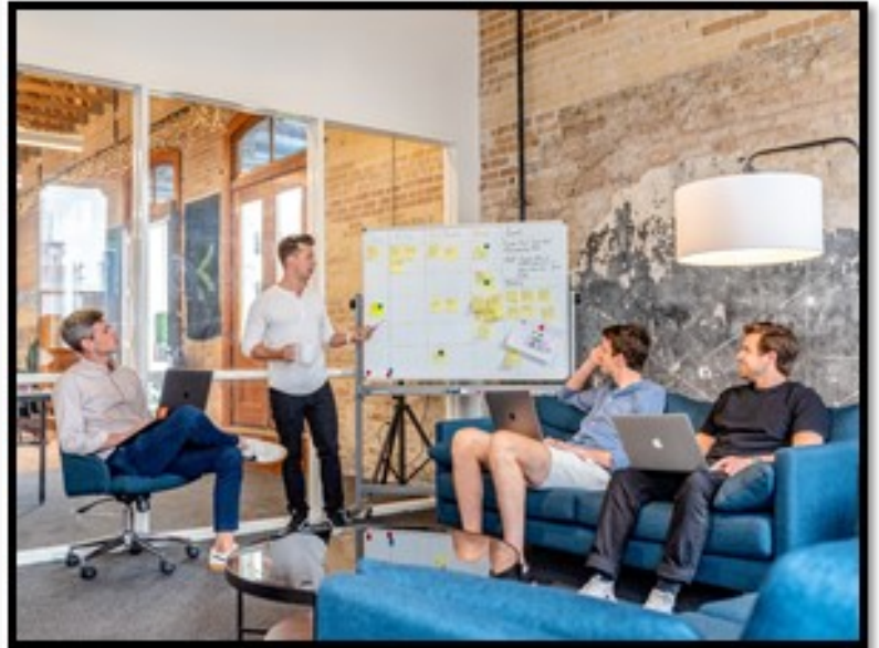
Art of Vastu on Business

However, if you consider the reality of this rule, the reason why the center of the room should be empty is so there's nothing obstructing the path of energy that's flowing through the workspace. Anything made of metal, wood or plastic would create an unwanted hindrance. As a result, the area would seem darker and cluttered.