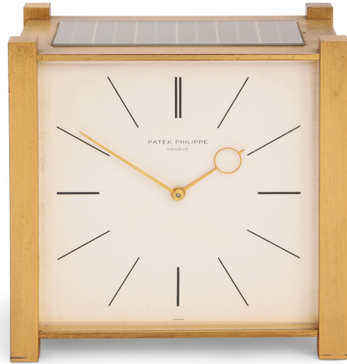
Interesting Patek Philippe gilt brass solar-powered square pendulette, circa 1965 ($4,000).