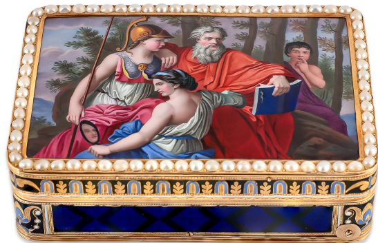
This wonderful Swiss enameled 18kt gold musical snuff box by Jean-Georges Remond & Compagnie, circa 1800, more than doubled its estimate of $20,000-30,000 to sell for $70,000.

This press release can be viewed online at: https://www.einpresswire.com/article/526549866 EIN Presswire's priority is source transparency. We do not allow opaque clients, and our editors try to be careful about weeding out false and misleading content. As a user, if you see something