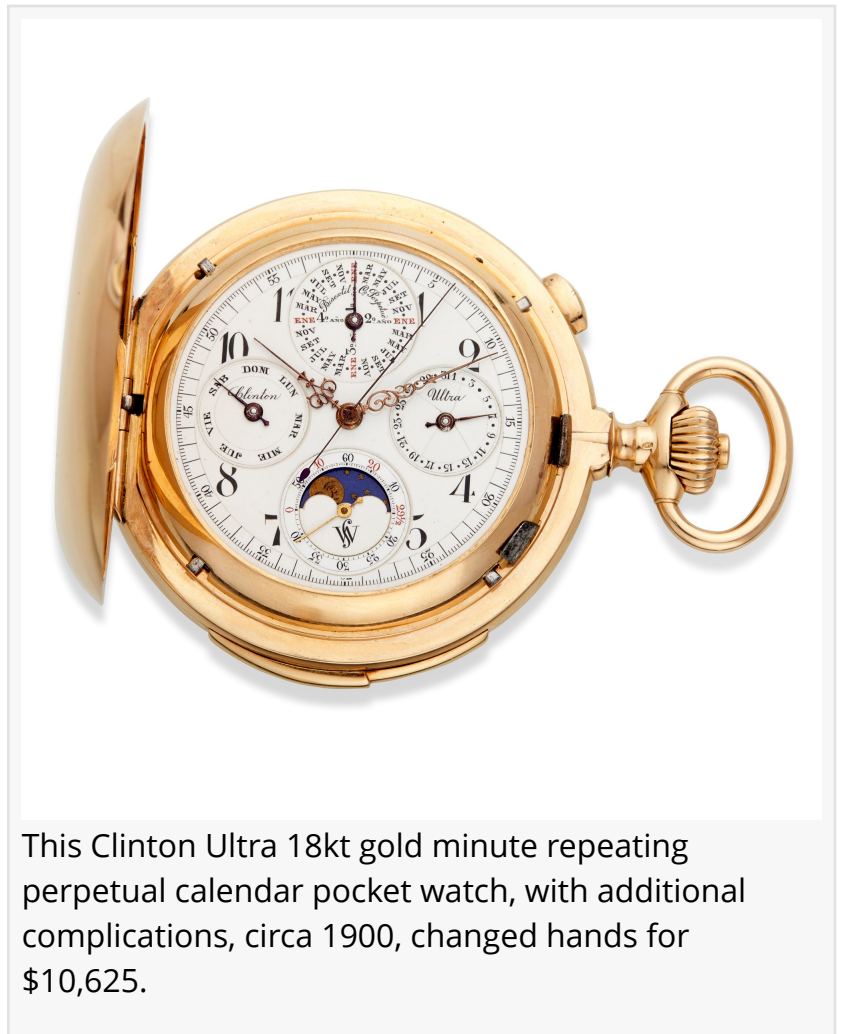
This Clinton Ultra 18kt gold minute repeating perpetual calendar pocket watch, with additional complications, circa 1900, changed hands for $10,625.