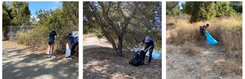
National CleanUp Day volunteers filled many bags of trash along the Alameda Creek in the Niles area.