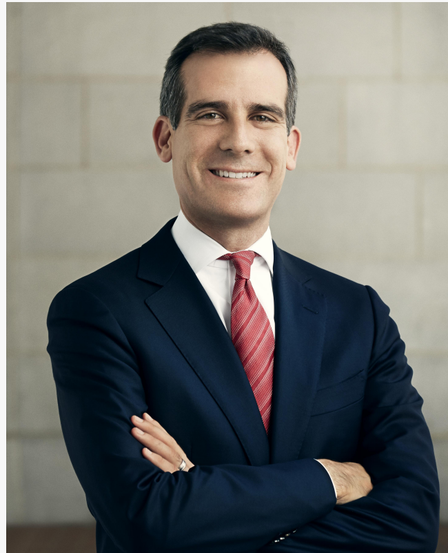
Eric Garcetti, Mayor of Los Angeles