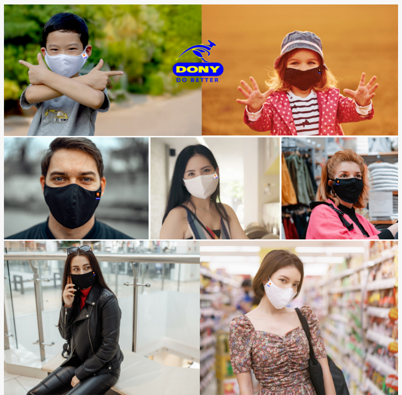
DONNY MASK - premium antibacterial cloth face mask (washable, reusable) with CE, FDA, TUV Reach, DGA Certification

Apart from the PPEs and Masks Dony Garment has been in the field of designing elegant uniforms for worker, and their designs and quality is popular all over the world. I ordered printed T-shirts and printed uniforms here. Quality products, very reasonable prices. Visiting at the workshop saw very large scale chemicals. There are countless shirt designs from other companies that have been customized before. I like 100% cotton at the shop's Uniform T-shirt. Very cool, soft, smooth. Price is also very good, reasonable price Enthusiastic staff advises", says