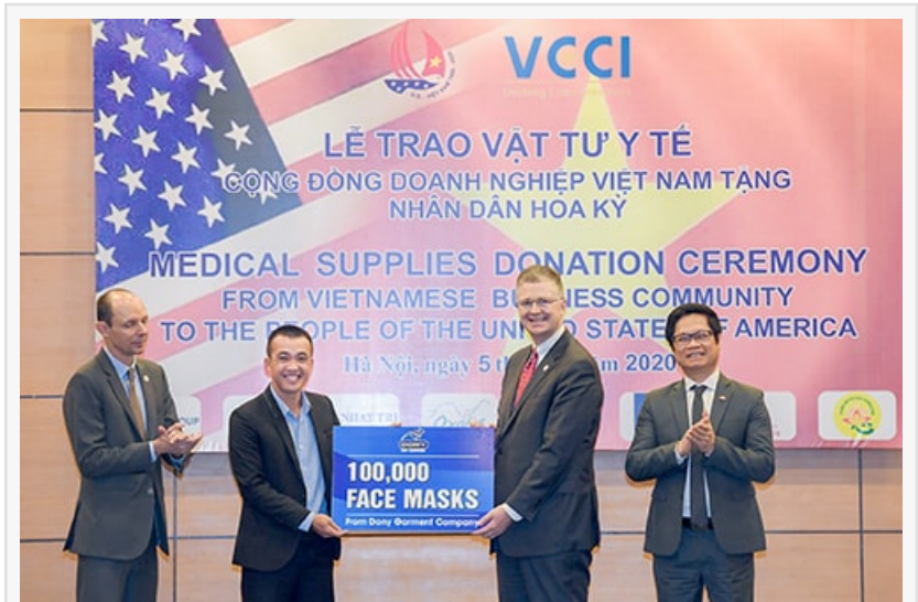
Dony Garment Company along with other Vietnamese enterprises donated medical supplies to the US

Vietnam gains international recognition as top quality brand for ppe and face masks meeting worldwide quality standards