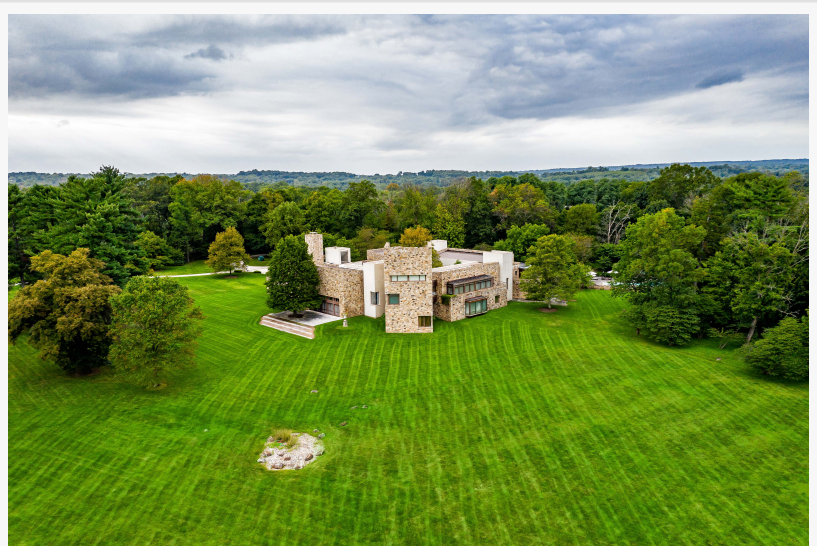
Mature trees and rolling hills surround the striking stone facade of Arbor Hill.