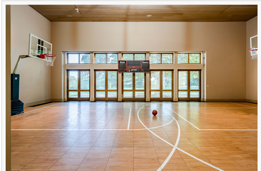
Interior basketball court at Arbor Hill.

Krystal Aeby Concierge Auctions +1 212-202-2940 email us here