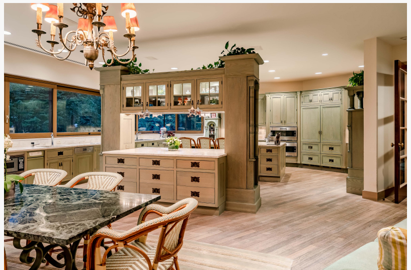
The public spaces occupy two wings, encompassing a large chef's kitchen, two dining rooms, a great room, and a theater.